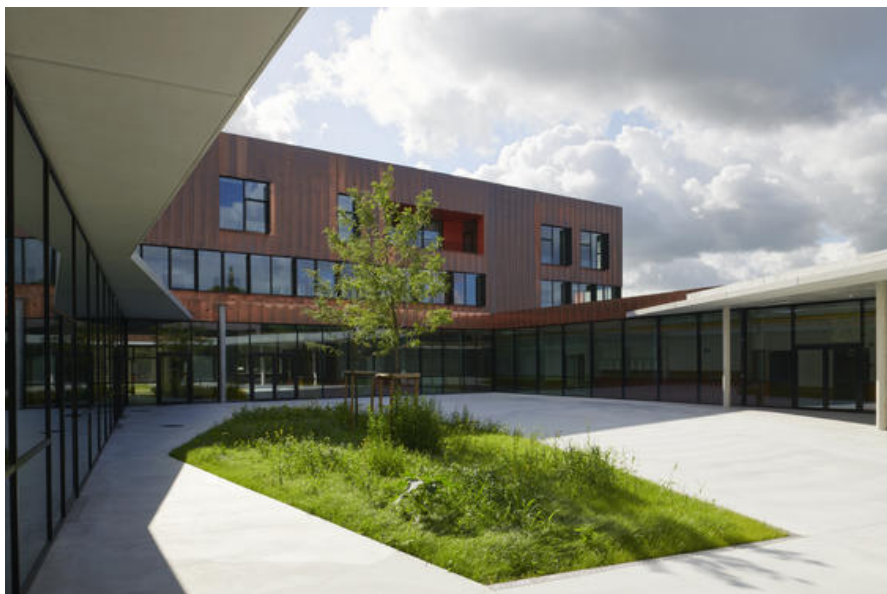
Â© Alain Janssens