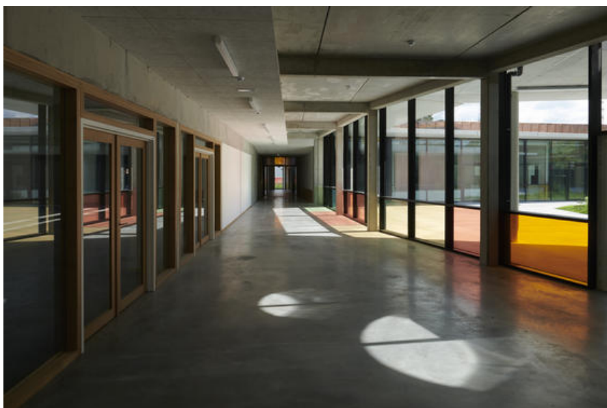
Â© Alain Janssens