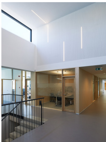
Â© Alain Janssens