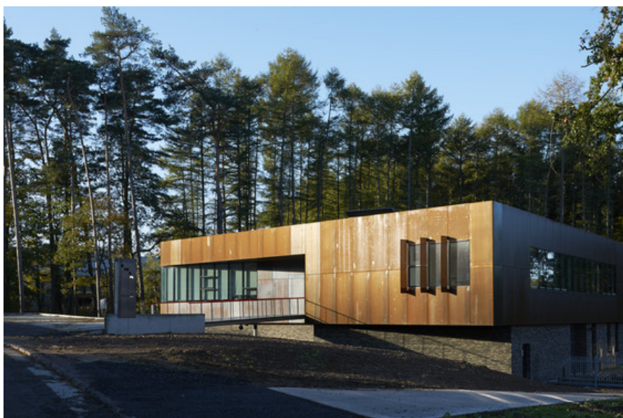
Â© Alain Janssens