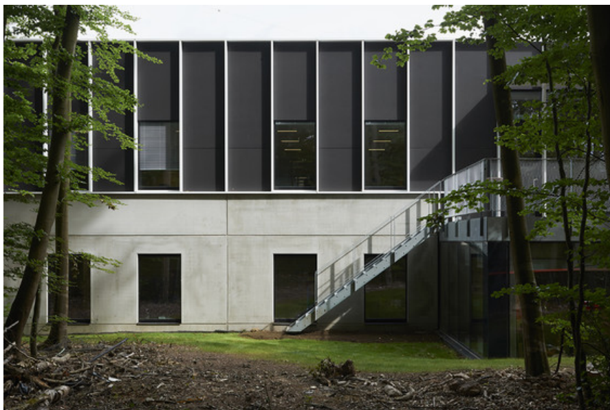
Â© Alain Janssens