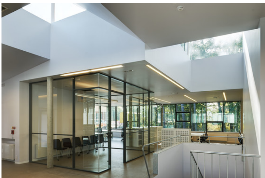
Â© Alain Janssens