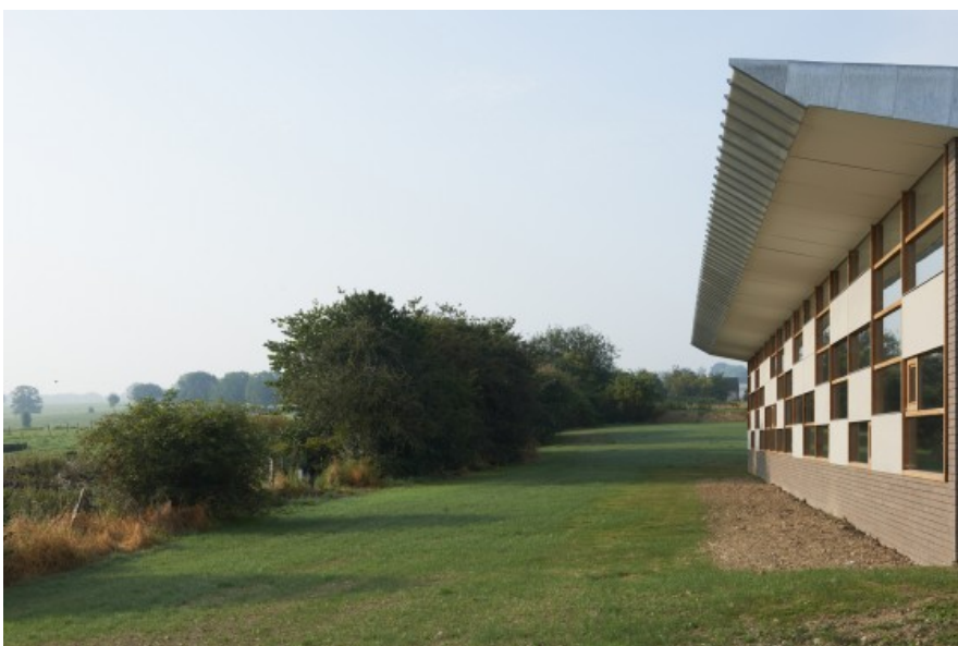
Â© Alain Janssens

Sports center of "l'Eau d'Heure" - 2009-2011 2013 - Froidchapelle