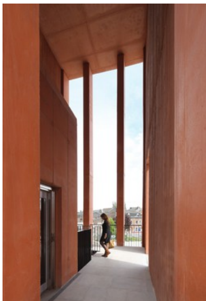
Â© Filip Dujardin