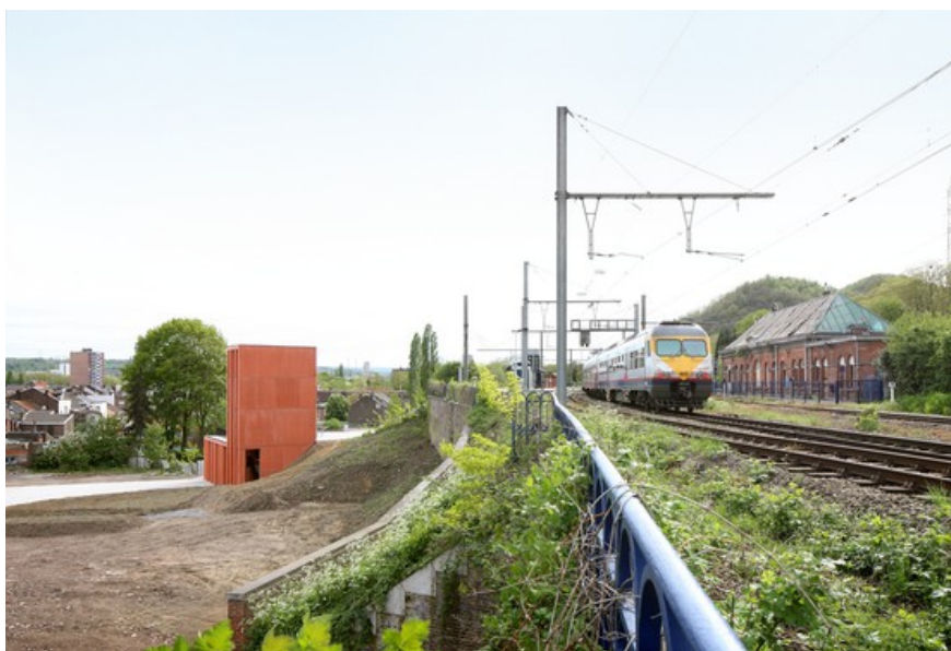
Â© Filip Dujardin