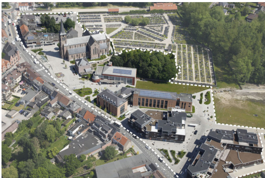
Â© ARJM architecture et urbanisme