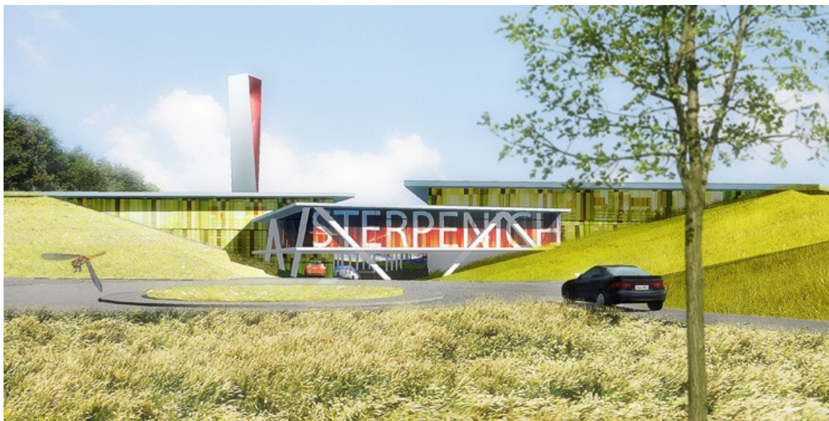
Â© ARJM architecture et urbanisme