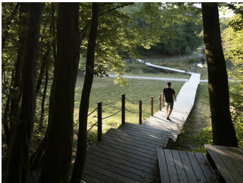
Â© Maxime Vermeulen