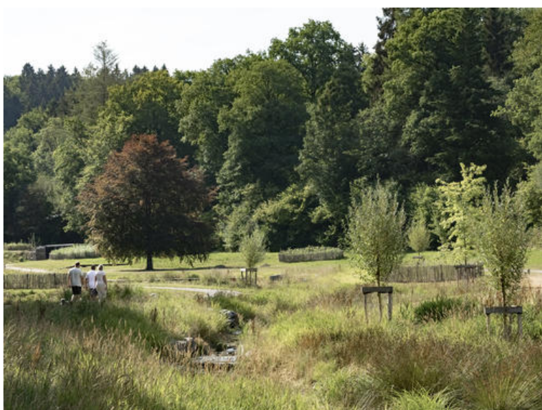
Â© Maxime Vermeulen