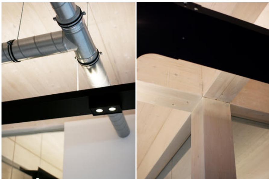
Â© Benjamin Bulot