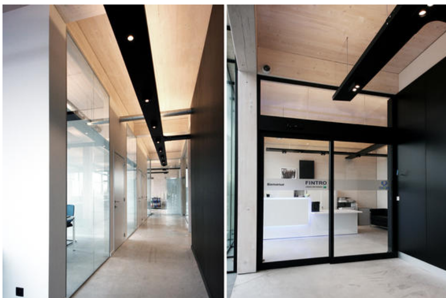
Â© Benjamin Bulot