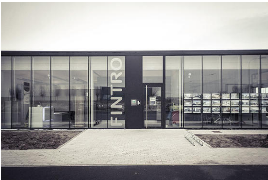
Â© Benjamin Bulot