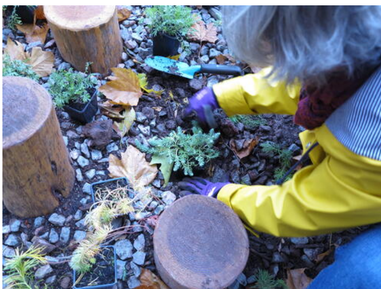
Â© Alive Architecture