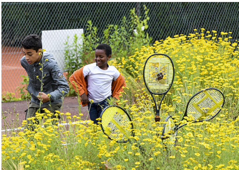
Â© Alive Architecture