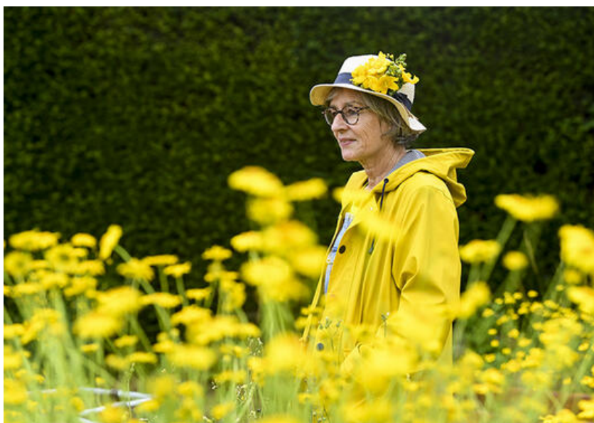
Â© Alive Architecture