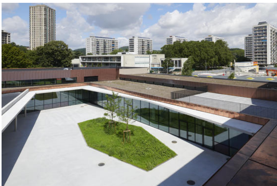
View from the first floor