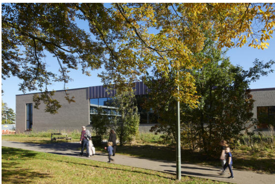
View from the park