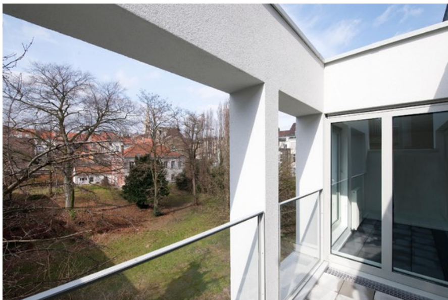
the terrace of a home with the view to a private park