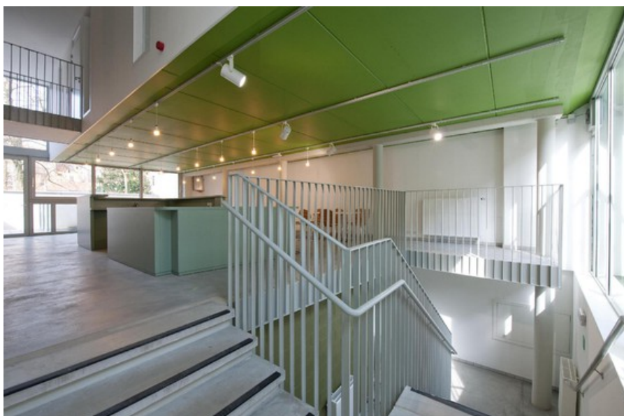
the tavern