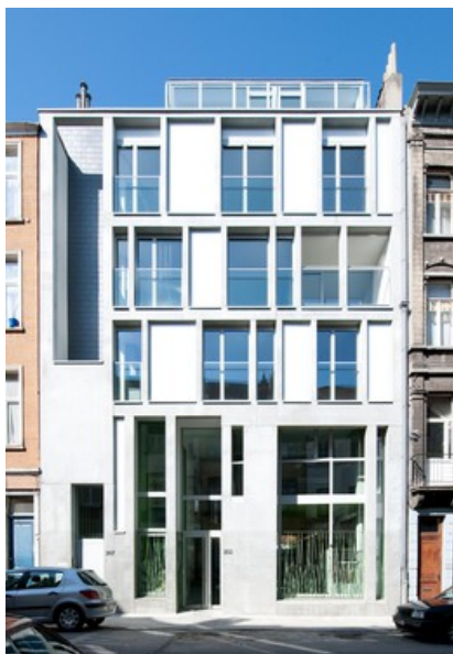
woven concrete facade Â© Marc Detiffe