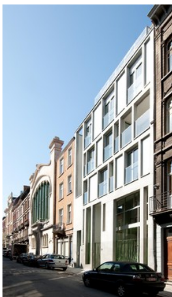
dialogue of public buildings