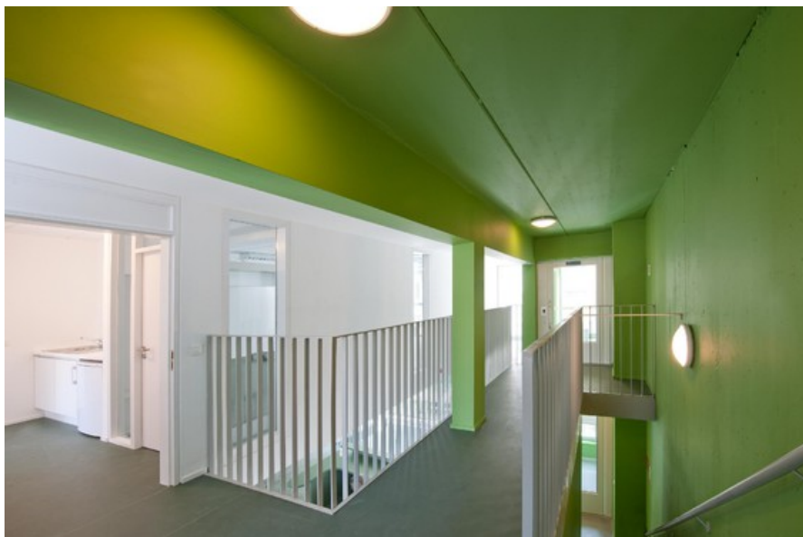
the light space