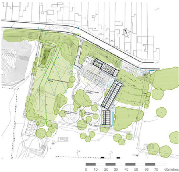
Site plan © AIUD