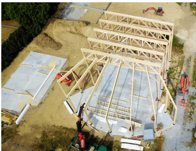
Aerial view wood frame