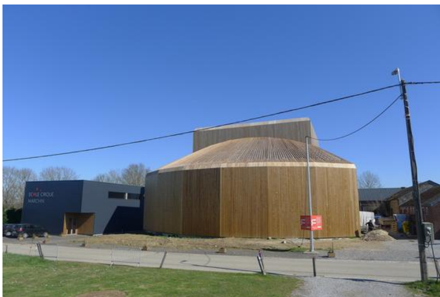
Main façade Â© Atelier MW