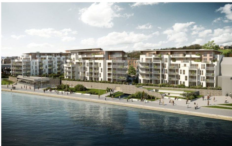
Â© Atelier de l'Arbre d'Or sa