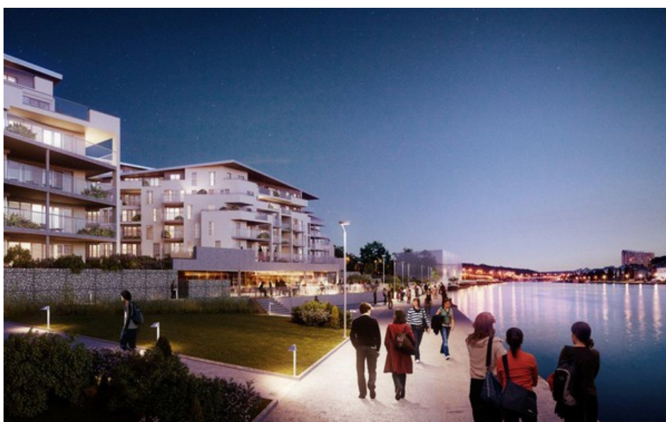
Â© Atelier de l'Arbre d'Or sa