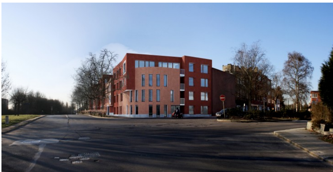
Â© Atelier de l'Arbre d'Or sa