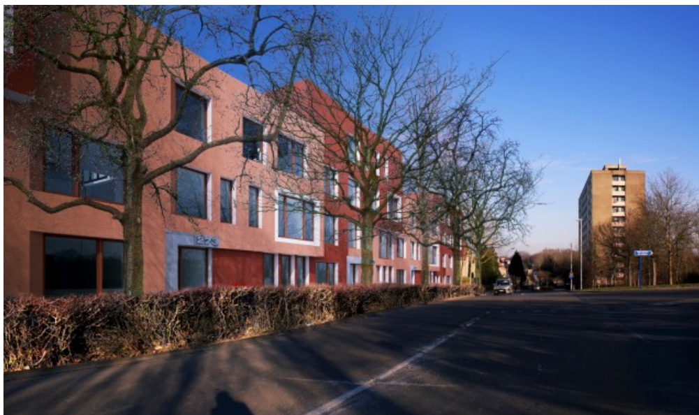
Â© Atelier de l'Arbre d'Or sa