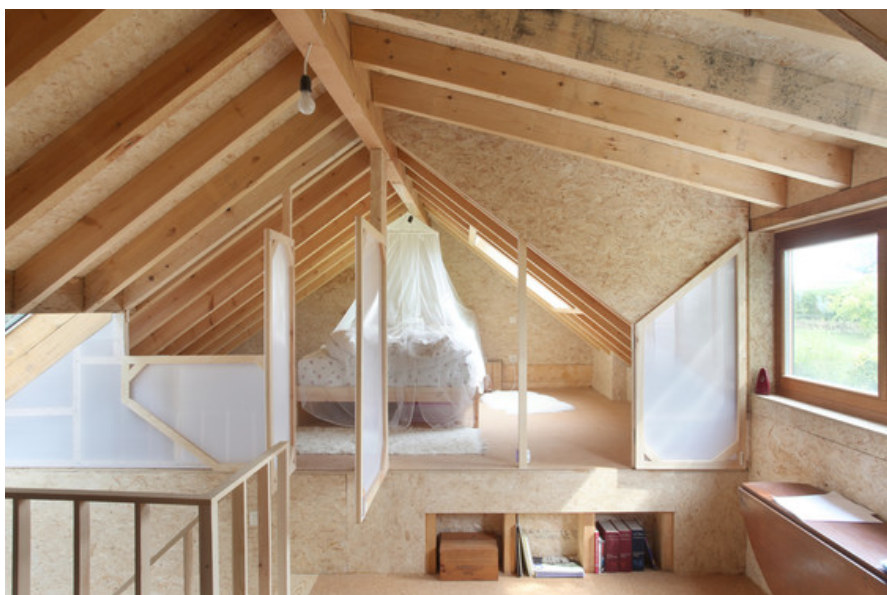
Inside view of the new upper floor