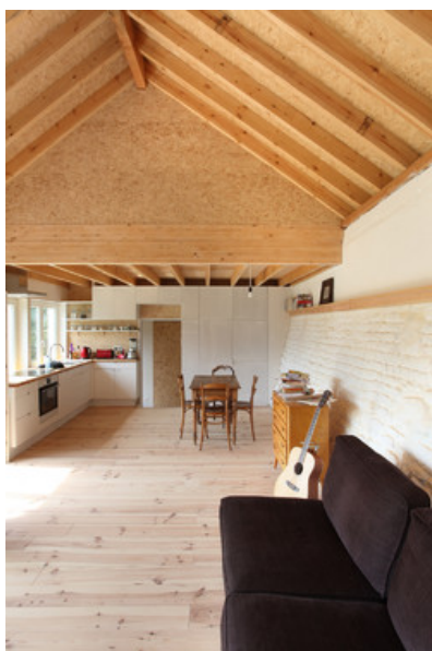
View from living spaces on the volume created for the new floor