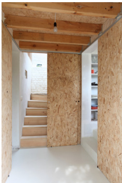
Inside view of the hall