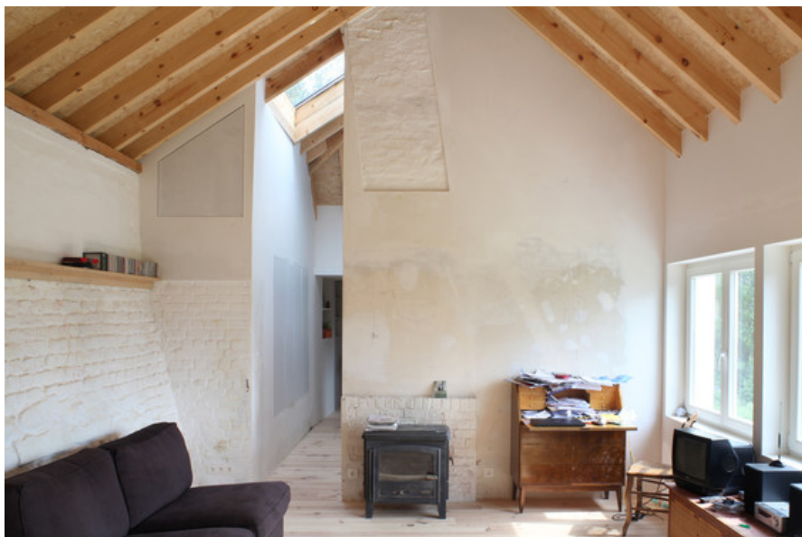
View on the central volume