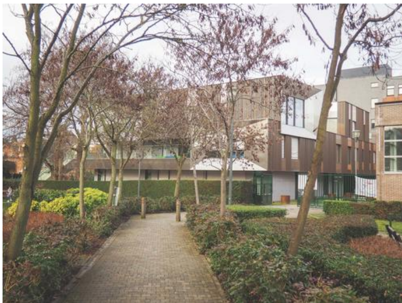
View of the nursery from the park Â© B612 Architectes