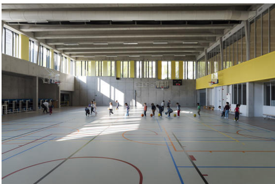
View on the Sporthall