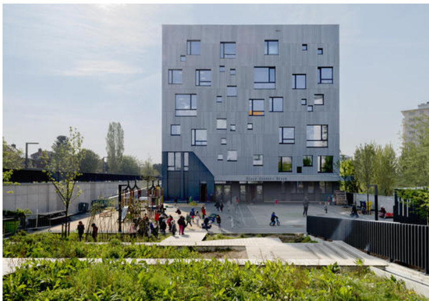
Vegetable Garden, Outdoor Forum and Kindergarden Playground