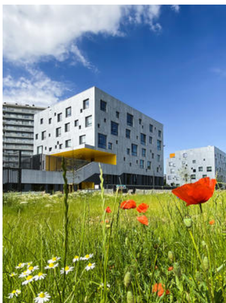
View on the Charmille and Schuman schools Â© B612 Architectes