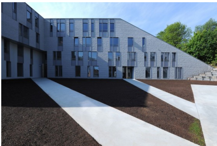
Â© B612 associates