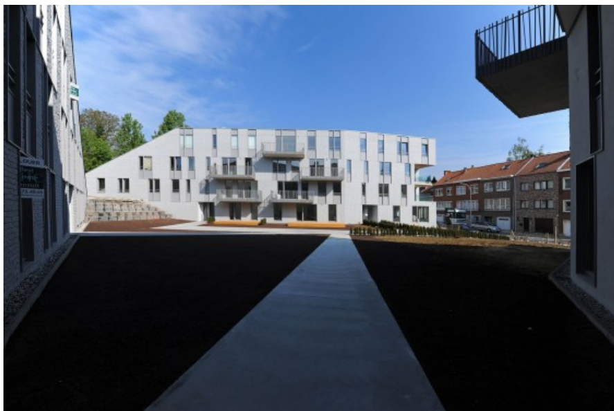
Â© B612 associates