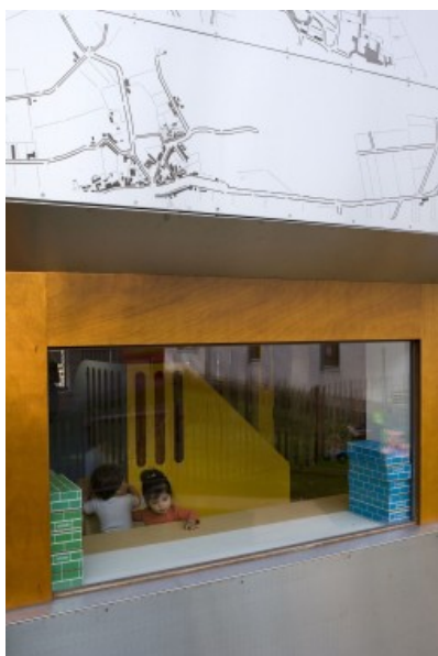
Â© B612 associates