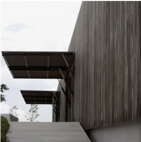
Â© Kris Vandamme