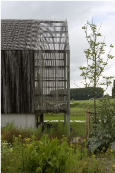
Â© Kris Vandamme