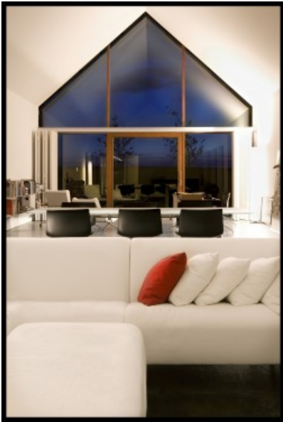
Â© BURO II & ARCHI+I