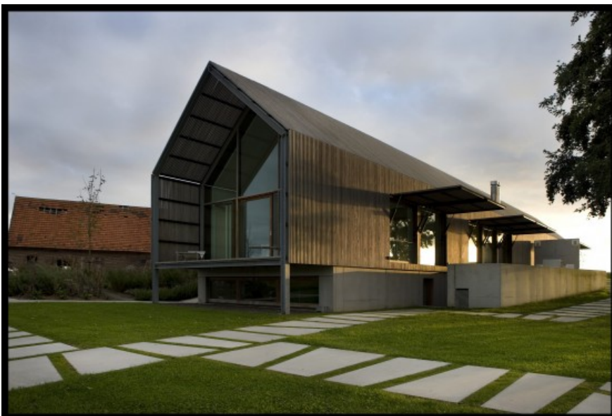
Â© Kris Vandamme