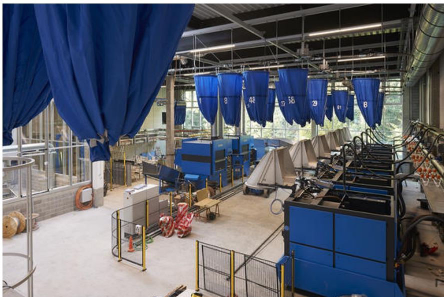
Â© Alain Janssens