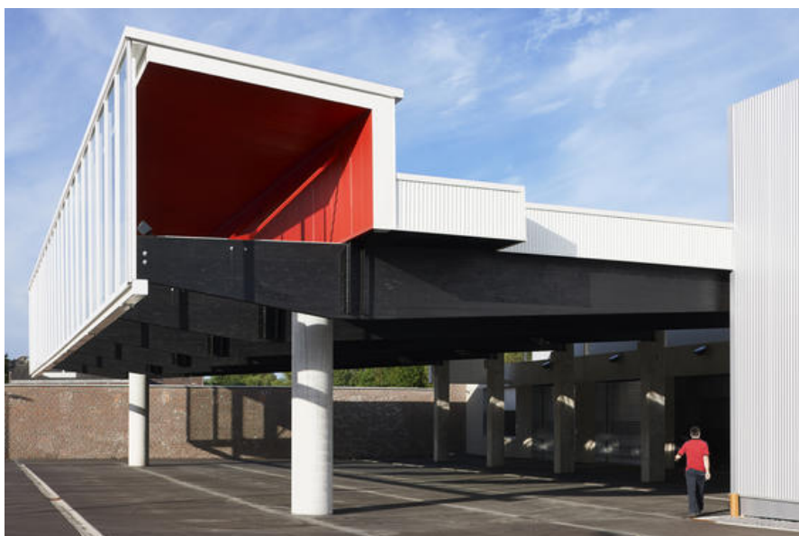
Â© Alain Janssens