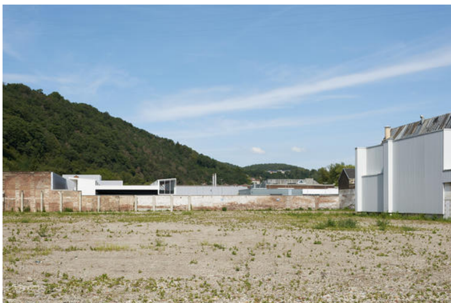
Â© Alain Janssens