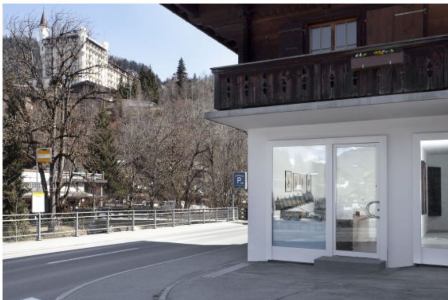
Â© Maxime Delvaux