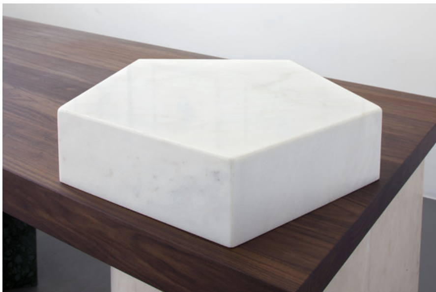
Â© Maxime Delvaux