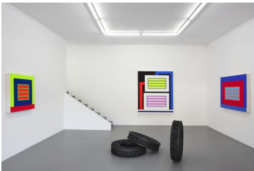
Â© Maxime Delvaux