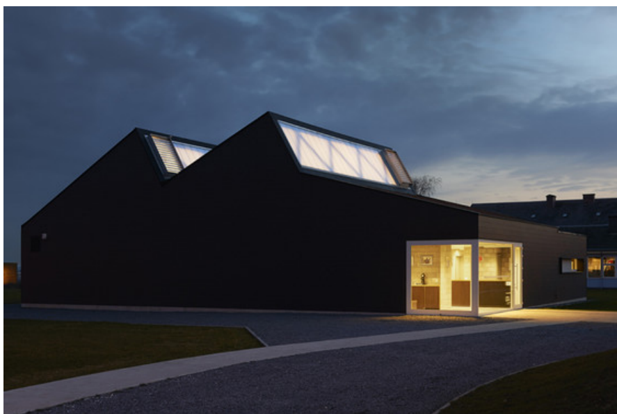
Â© Alain Janssens