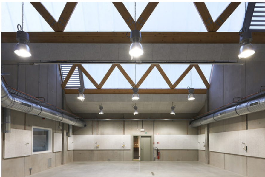
Â© Alain Janssens