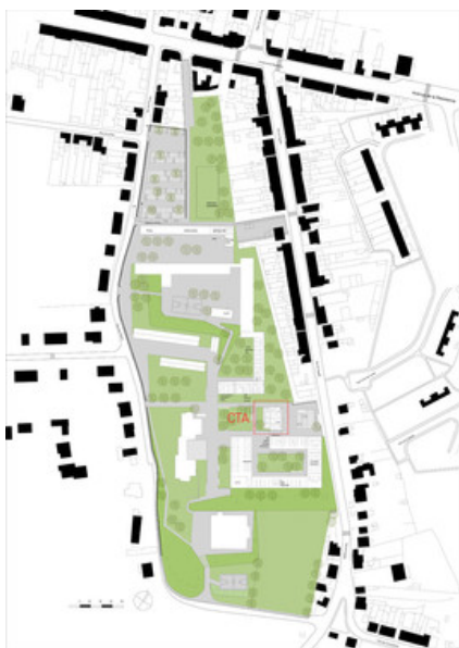
Â© Binario architectes