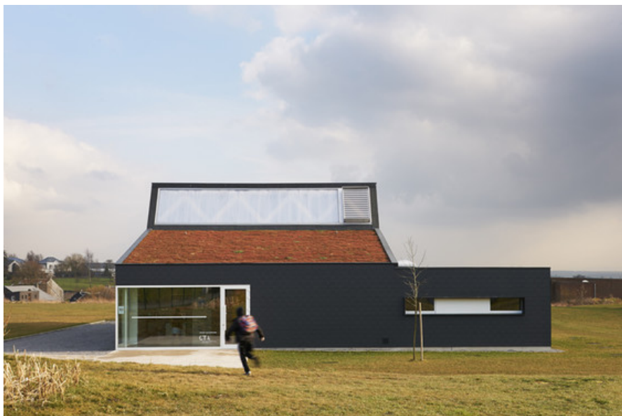
Â© Alain Janssens