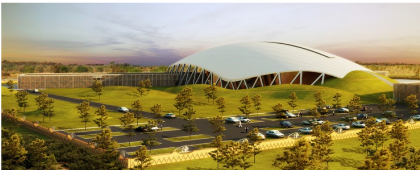
General view 1