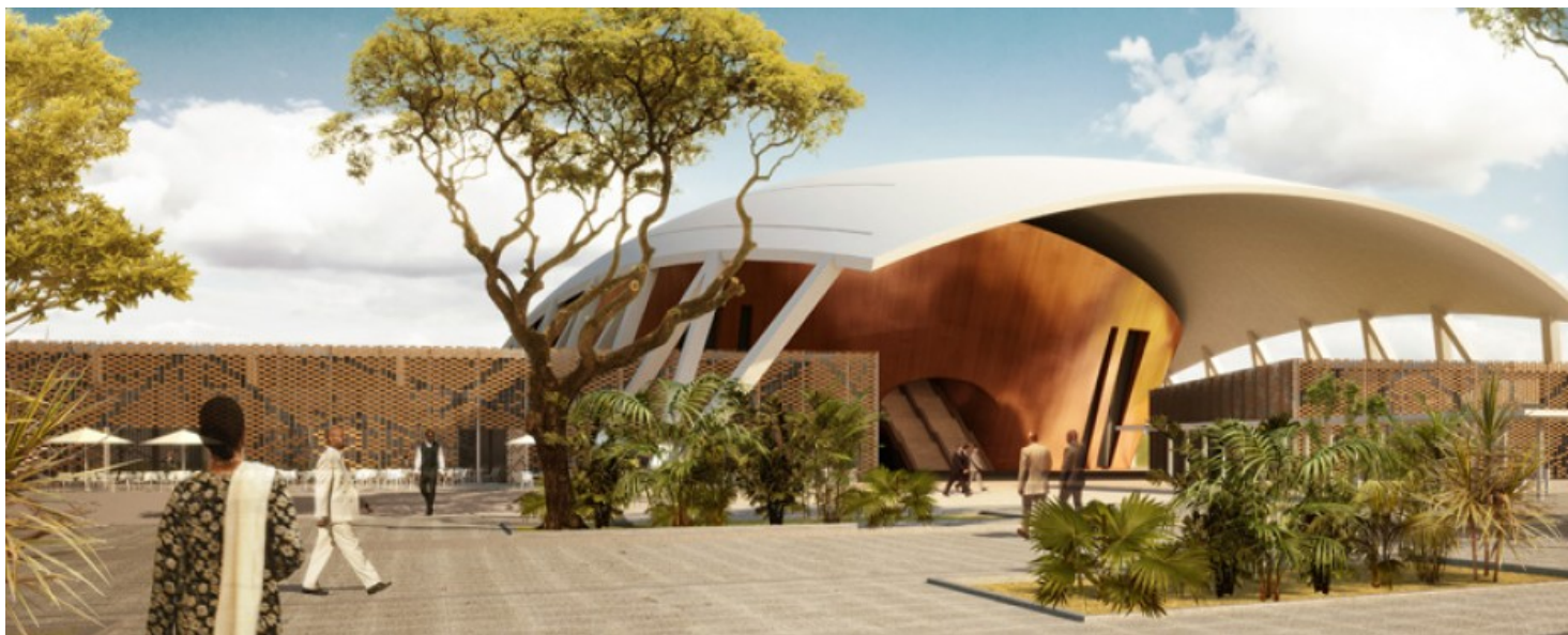
Entrance view