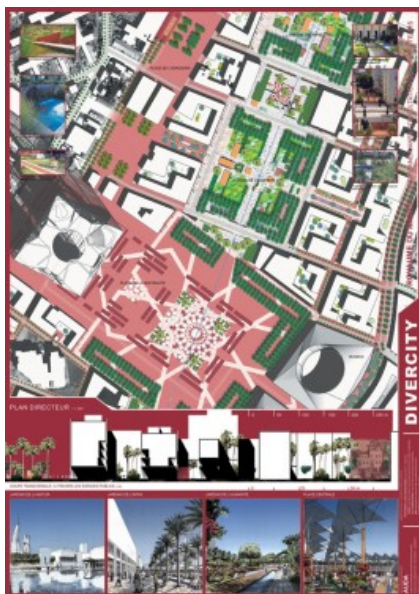
International competition - Panel 3 Â© CERAU Architects Partners