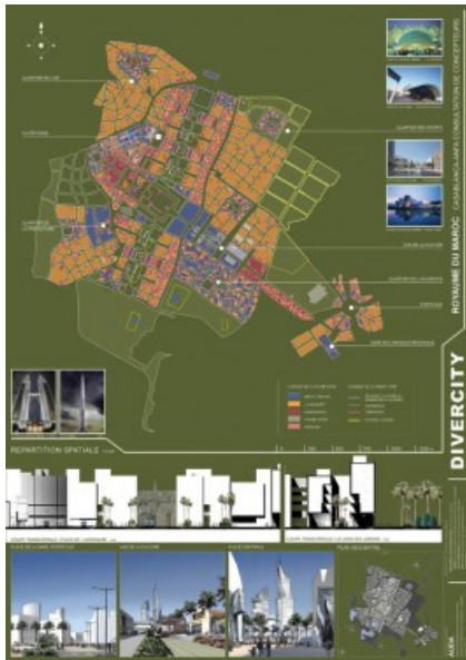
International competition - Panel 2 Â© CERAU Architects Partners