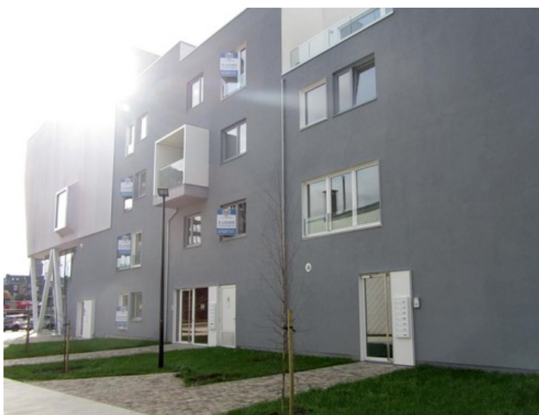
Â© CrÃ©ative Architecture sprl