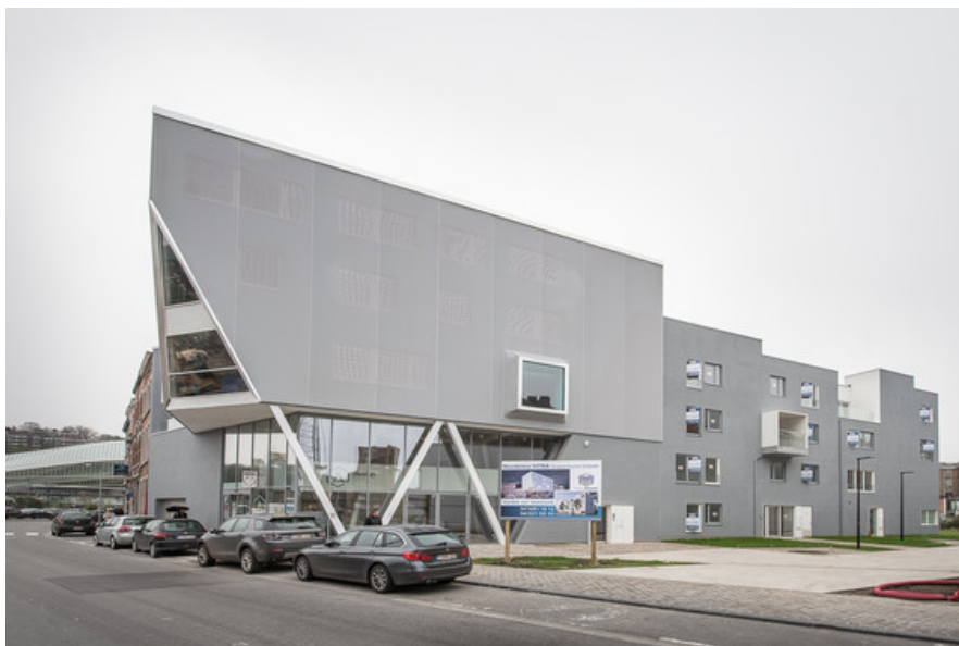
Â© CrÃ©ative Architecture sprl