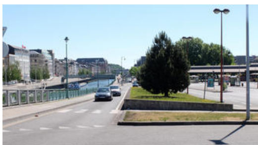
Charleroi - Quai de la gare du Sud