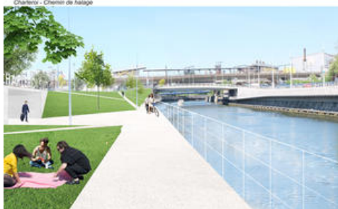
The towpath before and after (competition image)