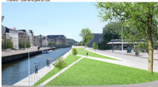
The Quai de la gare du Sud (competition image)