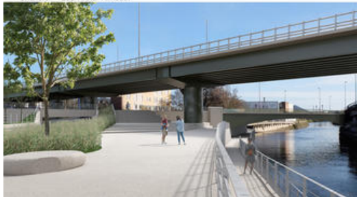
The Quai Arthur Rimbaud before and after.