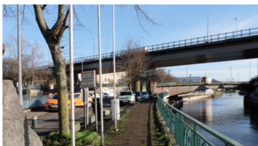
Charleroi - Quai Arthur Rimbaud