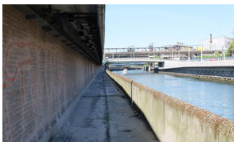
Charleroi - Chemin de halage