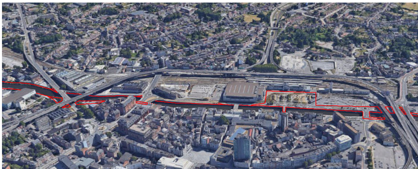
The redevelopment of the Sambre quays, a project that crosses the city center of Charleroi and organizes the interface between logistics infrastructure and the city center, Â© Google