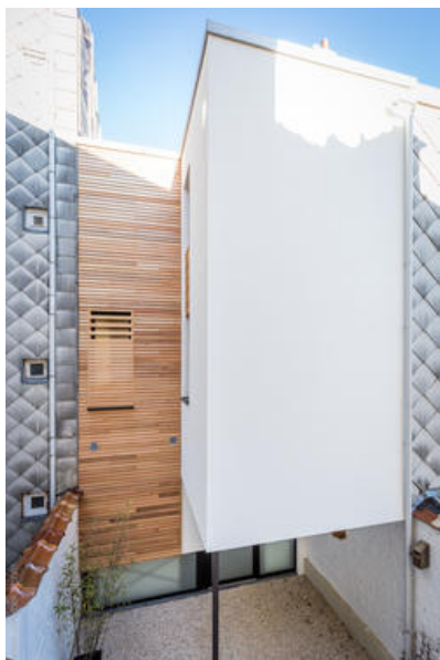
Back facade