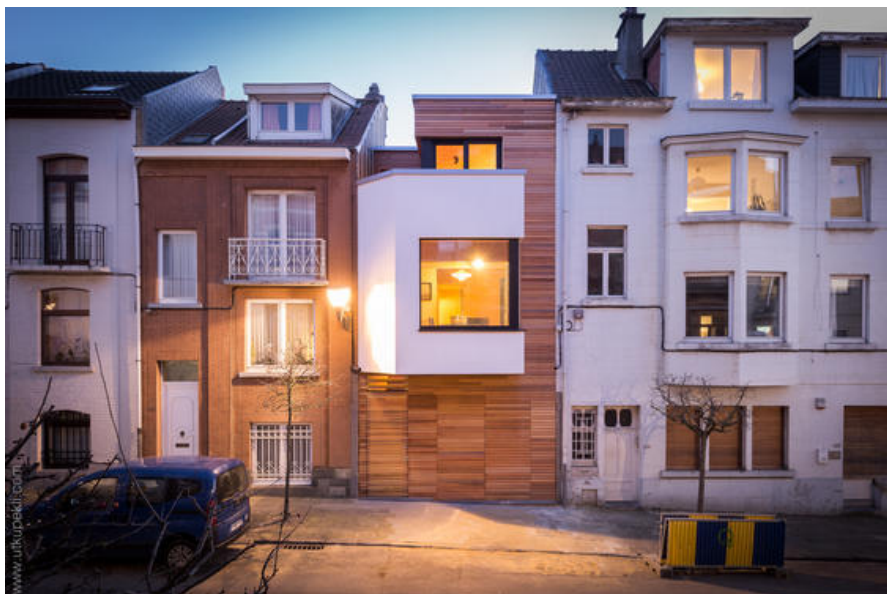
Front facade Â© Utlu Pekli