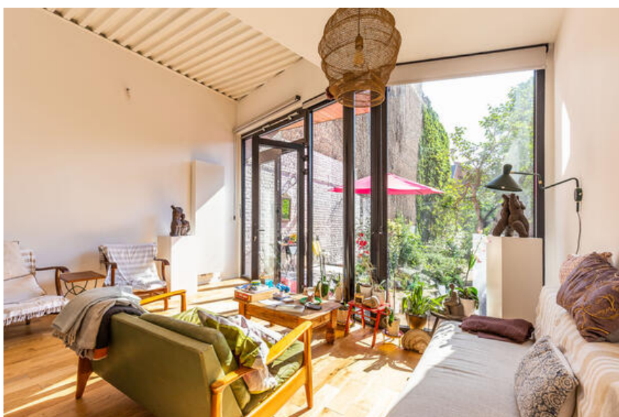
Â© @ Utku Pekli