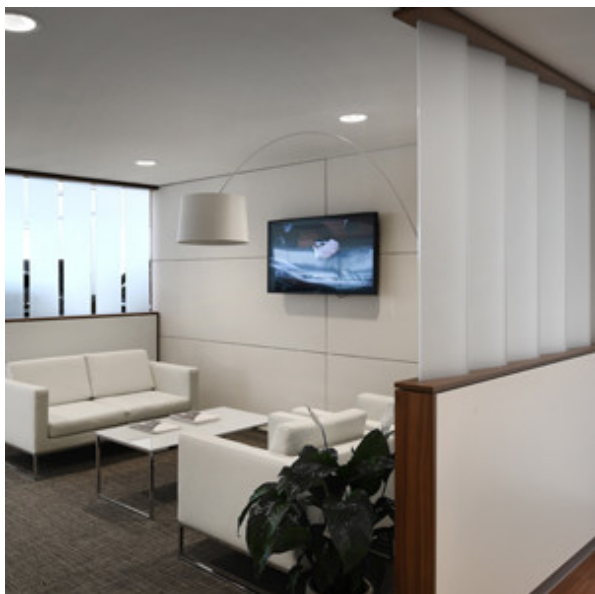
Â© FCM Architects