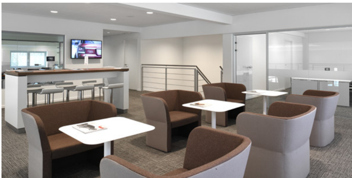
Â© FCM Architects