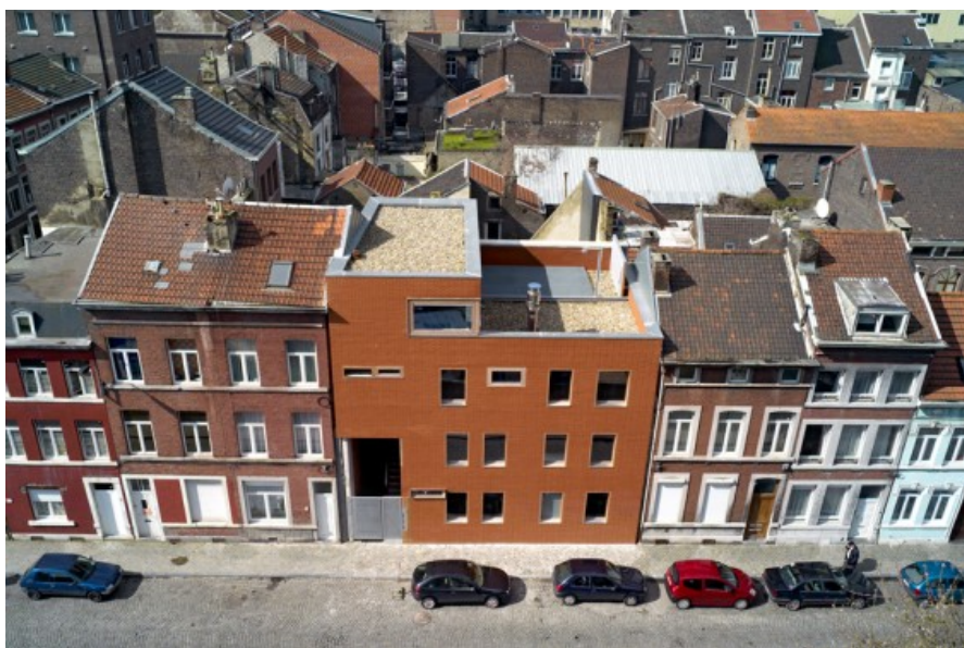
Â© Carl Havelange