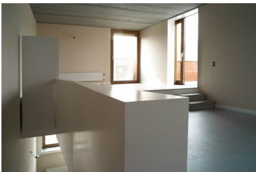
Â© Carl Havelange