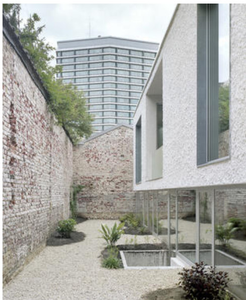
South Facade