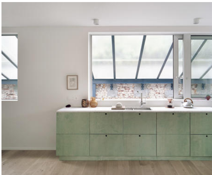
kitchen Â© Max Delavaux