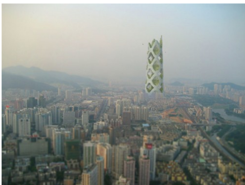
© JDS Architects Julien De Smedt