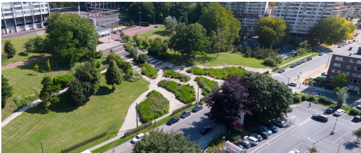
Â© JNC International s.a. "Joining Nature and Cities"