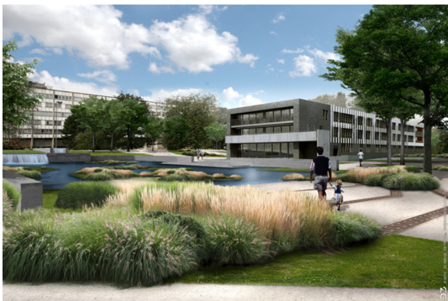
Â© JNC International s.a. "Joining Nature and Cities"