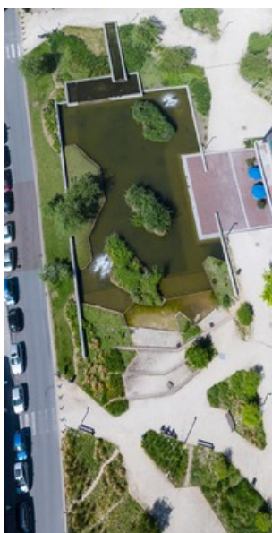
Â© JNC International s.a. "Joining Nature and Cities"