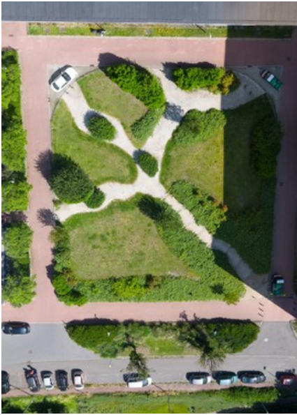
Â© JNC International s.a. "Joining Nature and Cities"