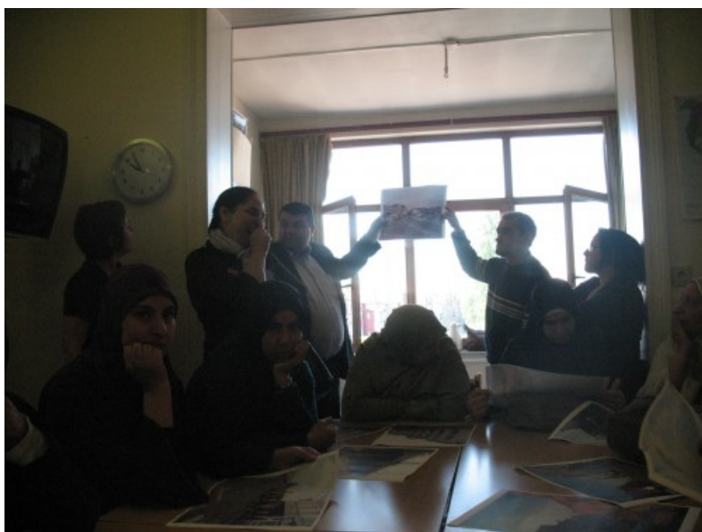
Â© IPE collectif