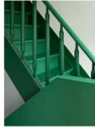
Bovenhuis typology : Construction delivery Â© Maxime Vermeulen