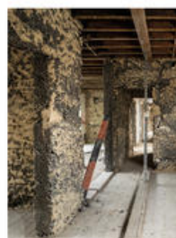
Typology K: Construction site