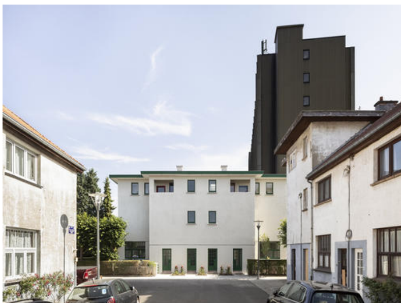
Fondation Street