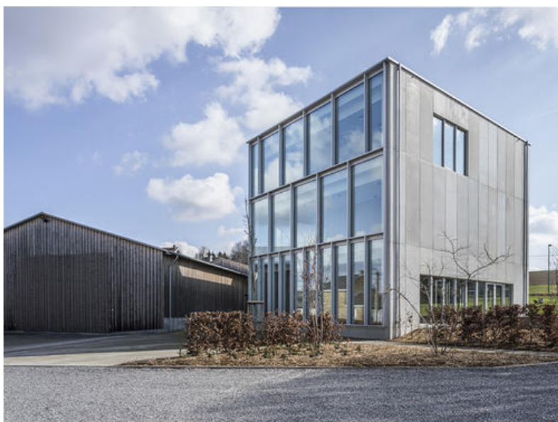
Â© Vermeulen Maxime