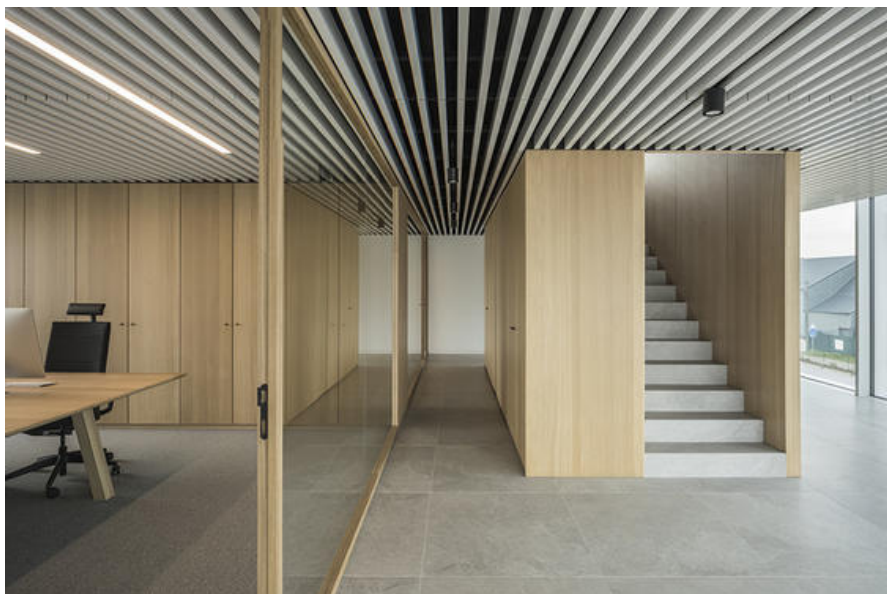
Â© Vermeulen Maxime