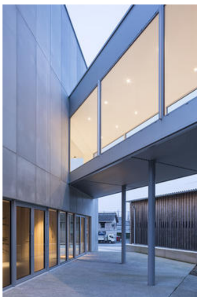
Â© Vermeulen Maxime