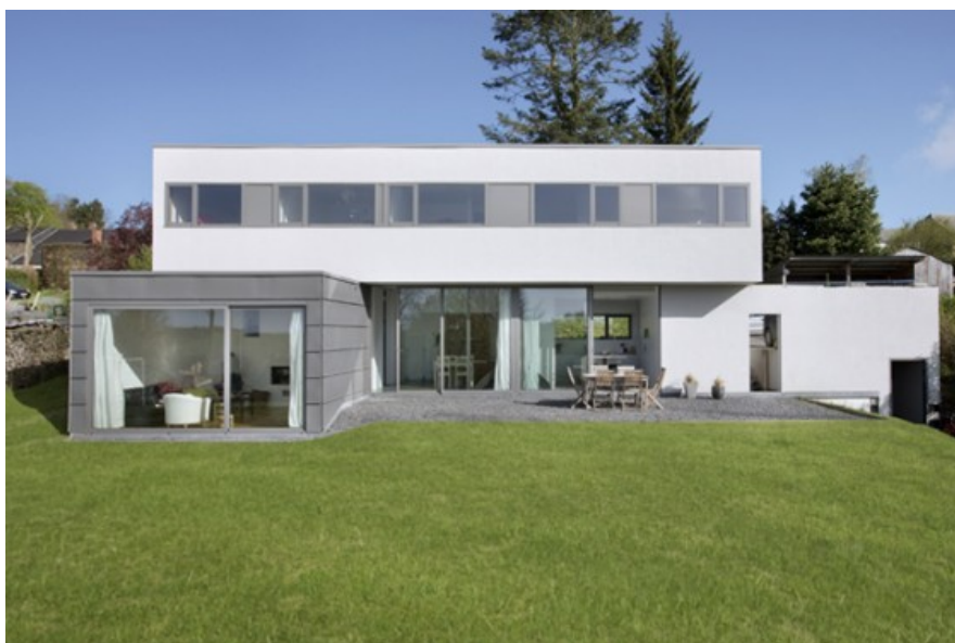
Â© Laurent Brandajs

School Barvaux-Condroz - 2008 2011 - Barvaux-Condroz