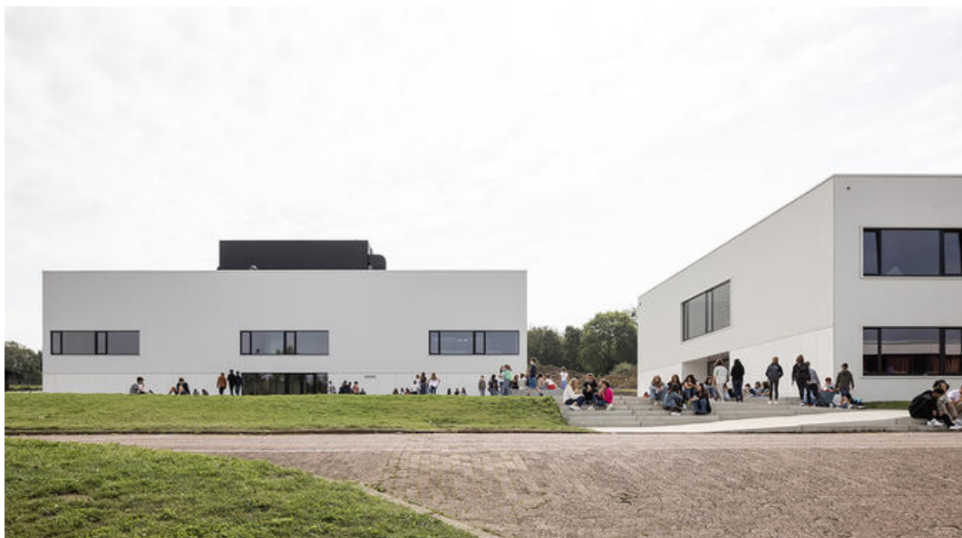
Â© Vermeulen Maxime