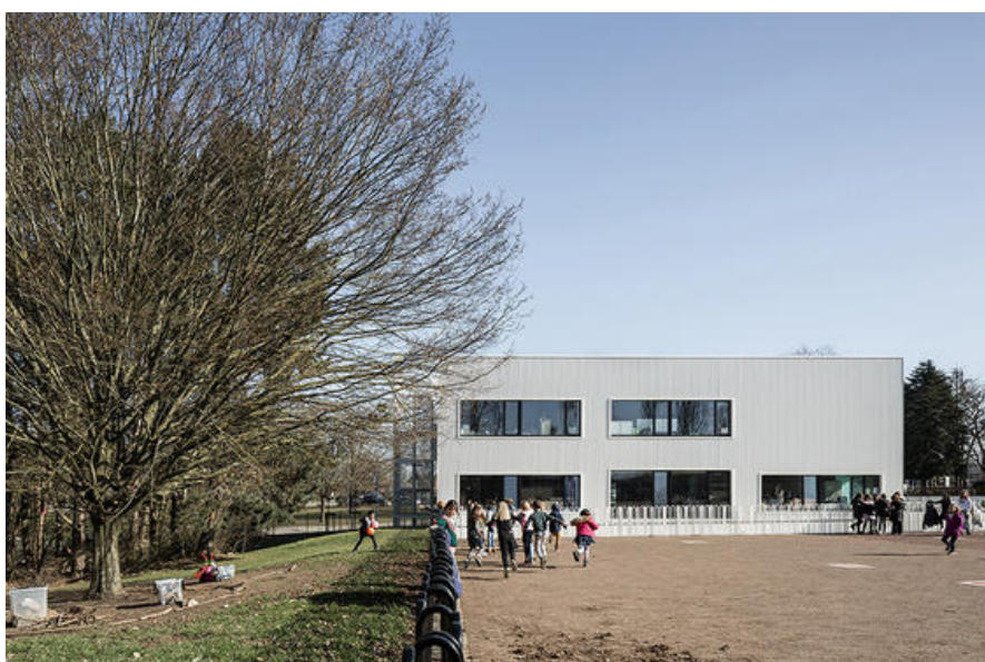
Â© Vermeulen Maxime