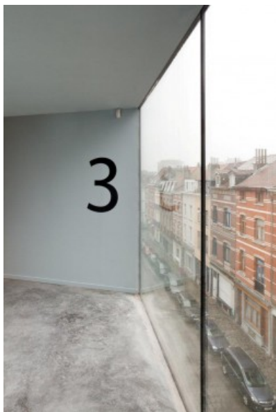
Â© Tim Van de Velde