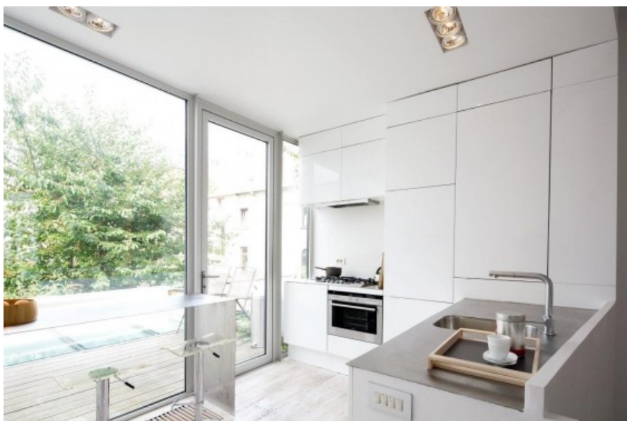
Â© Â Tim Van de Velde