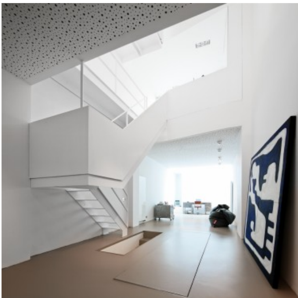
Â© Â Tim Van de Velde

Urban planning - 2010 2011 - Saint-Gilles