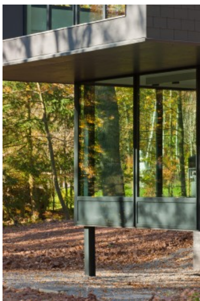
stand-alone dwelling © Marcel Van Coile