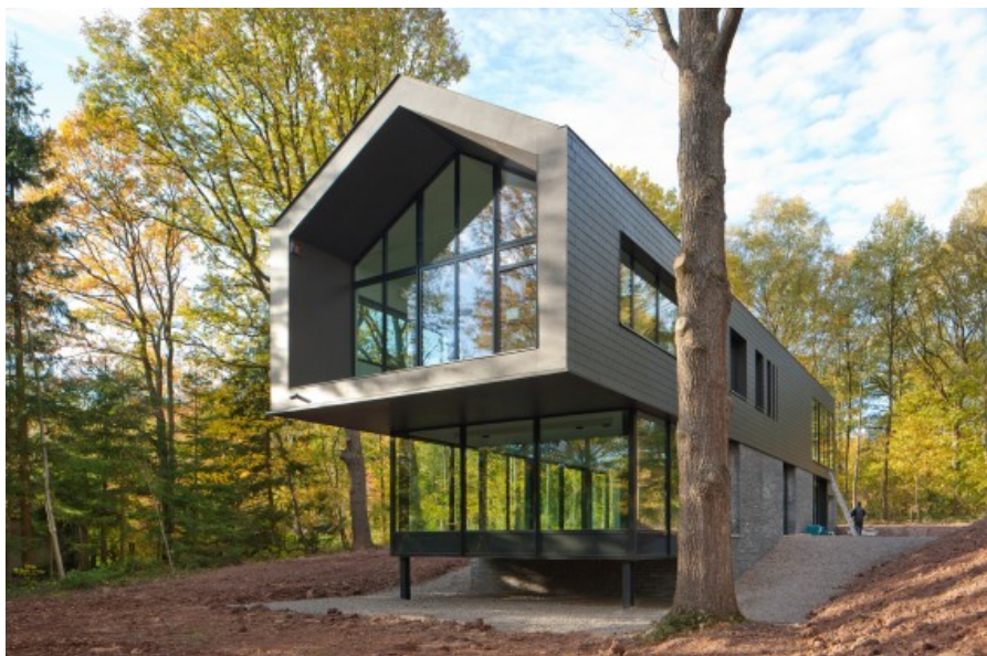
stand-alone dwelling