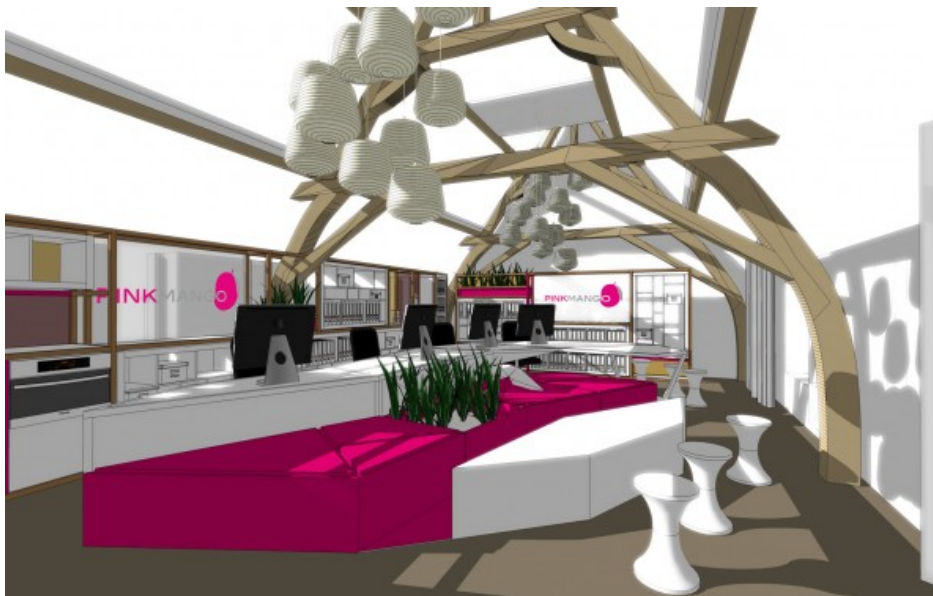
Office © MADE alchimie cr ative s.p.r.l.