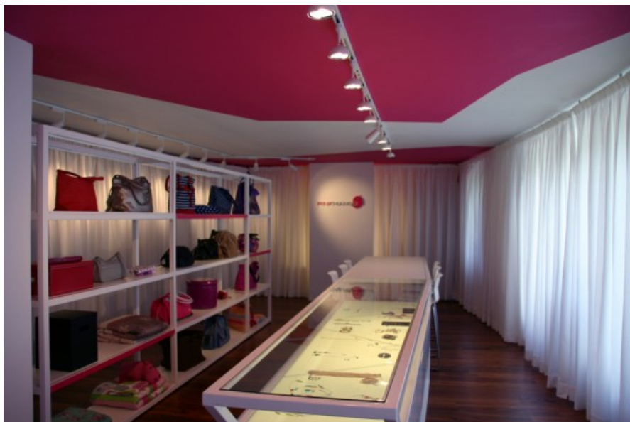
Showroom Â© MADe alchimie crÃ©ative s.p.r.l.