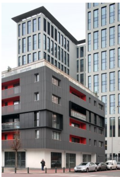
Â© Filip Dujardin