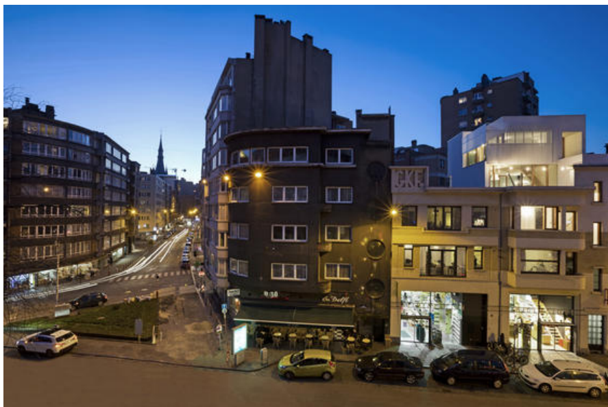
Â© L Brandajs