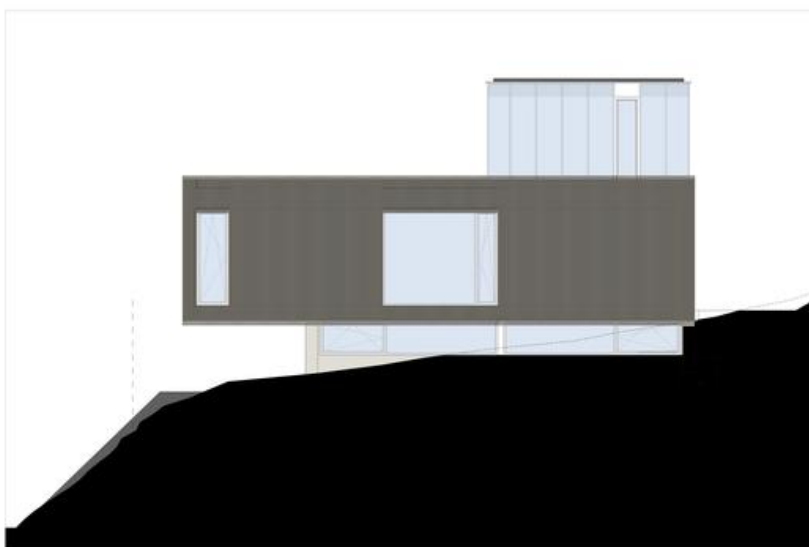
west elevation Â© Martiat+Durnez Architectes