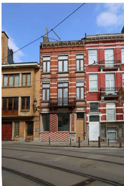
Â© Monsieur Pascal