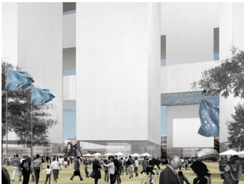
OMA-NFA, Plan Urbain Loi, 2009 Â© OMA-NFA