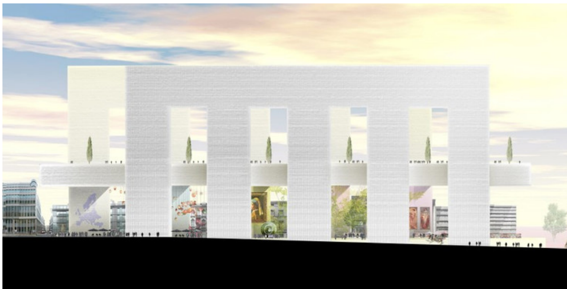
OMA-NFA, Plan Urbain Loi, 2009 Â© OMA-NFA