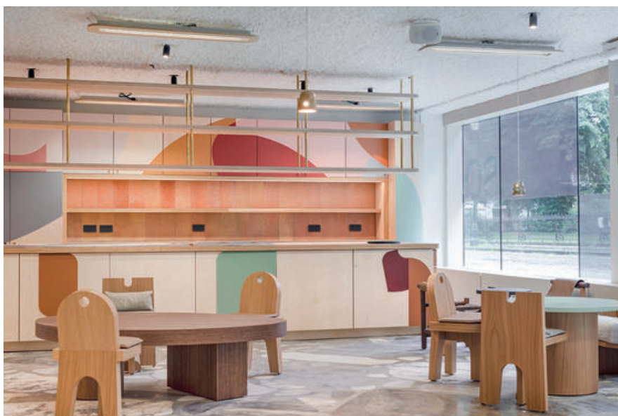
À© Jules Cesure